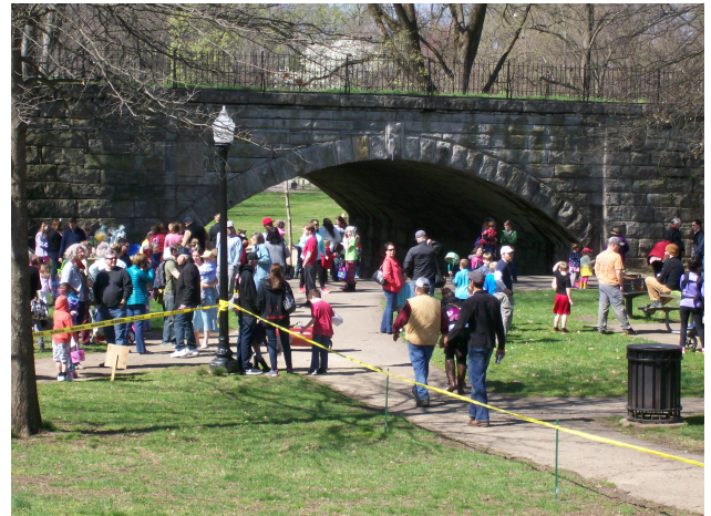
Photos from last year's Easter Egg Hunt