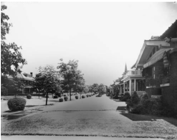
Windsor homes, 1921

We also plan to have our street festival in August again. We are looking at Saturday August 18. More excitement on Beechwood Avenue to come! — Brian Caudill