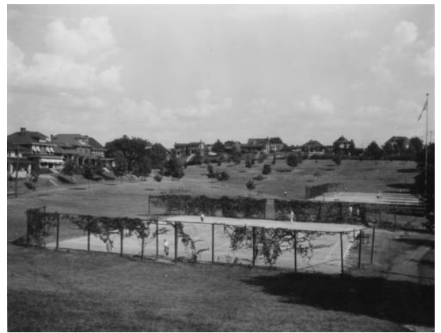
Tyler Park tennis courts with surrounding homes, 1913, Students at Lucia Avenue School (now Bloom), 1923