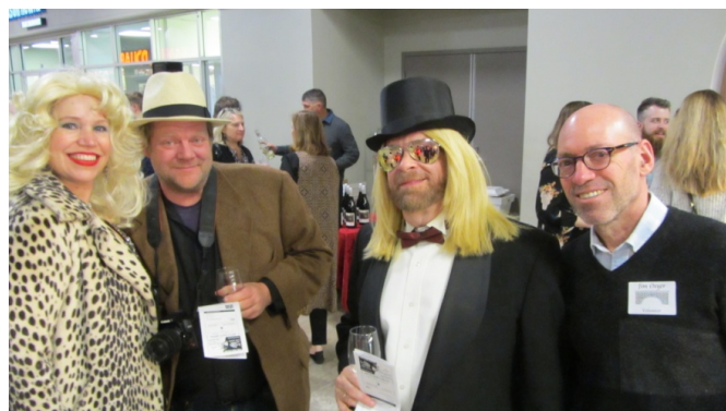
Hollywood stars enjoying the red carpet event.

The 11 th Annual Tyler Park Neighborhood Association Wine Tasting was held on Sunday, January 28th, at the Mid City Mall. Attendees were greeted on the red carpet as they entered the Hollywood-themed venue. The event featured California wines from the Wine Market, a variety of tasty hors d'oeuvres from ValuMarket's catering department, and an outstanding selection of award-winning cheeses from ValuMarket's deli department. ValuMarket's floral department provided the beautiful flower arrangements that decorated the venue. Proceeds from the fund raising event totaled $2500, and benefited Beechwood Park, a new pocket park located on Beechwood Ave.