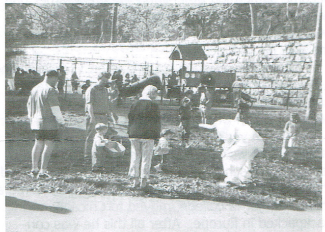
Photos from a previous Tyler Park Easter Egg Hunt.

It's almost that time of year again -- the time when the Easter Bunny visits Tyler Park. This year the egg hunt will be held on Saturday, April 10 (that's the day before Easter, as usual), from noon to 2:00 PM. There will be separate areas, with special prizes for the age groups three and under, 4-5-6, 7-8-9, 10-11-12. Older kids who want to participate can show up at 11:00 AM and be 'Bunny Helpers'. We will also have drawings for big prizes and a special visit from a large, furry friend. Please join us for this yearly Tyler Park tradition.