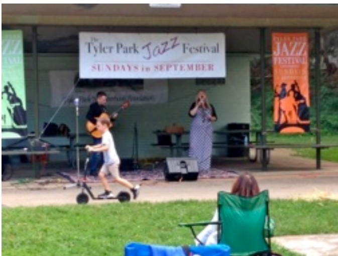
Sundays in September 2015. Jazz, beautiful weather and happy children make a perfect Sunday for everyone.