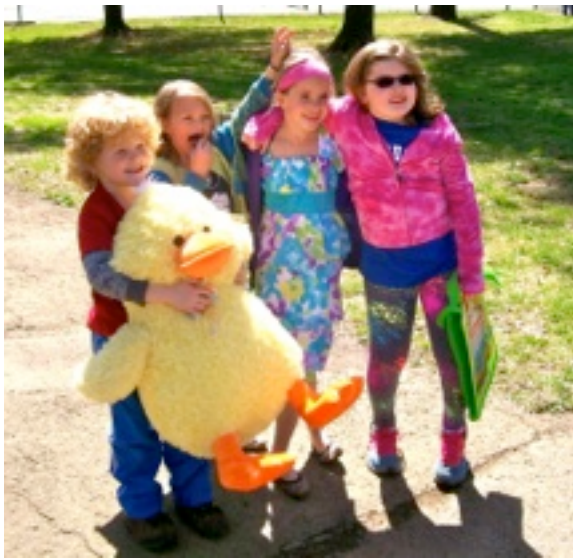
The Saturday before Easter is the Annual Tyler Park Neighborhood Association Easter Egg Hunt, a neighborhood favorite for the younger Tyler Park residents.