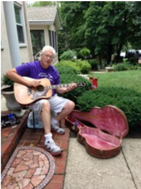
June is the Tyler Park Garden Tour. The 2015 tour featured live music in the gardens! Every year is a new adventure as well as new gardens.