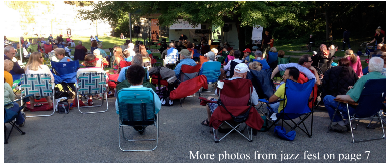
More photos from jazz fest on page 7