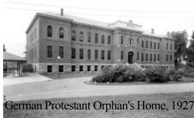
German Protestant Orphan's Home, 1927