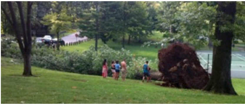
Tyler Park lost one of its big trees.