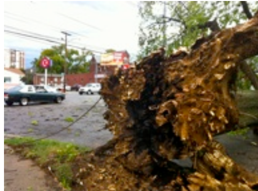
The roots from the tree that fell on Windsor at Bardstown Road.