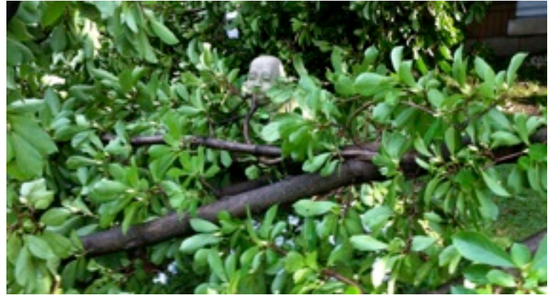
A tree fell all around him but Buddha remained safe.