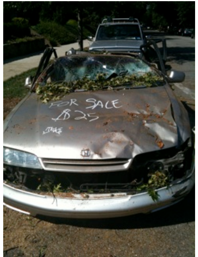
The car from page two for sale cheap.