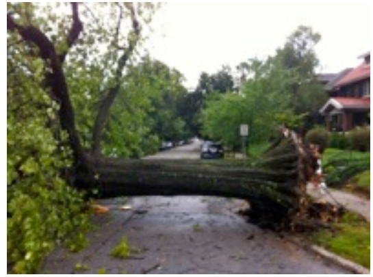
On Windsor at Bardstown Road a tree fell across the road and onto the car pictured below.