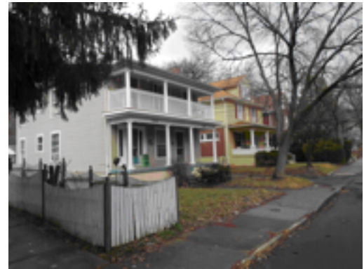
The text and the contemporary photograph of Tyler Parkway are © 2016 Ray Brundige

My conclusion is to show a newer version of the photo that ran in 1933, and to sympathize with The Neighborhood Reporter’s decision to skip the history and talk about the appealing little kids on the street.